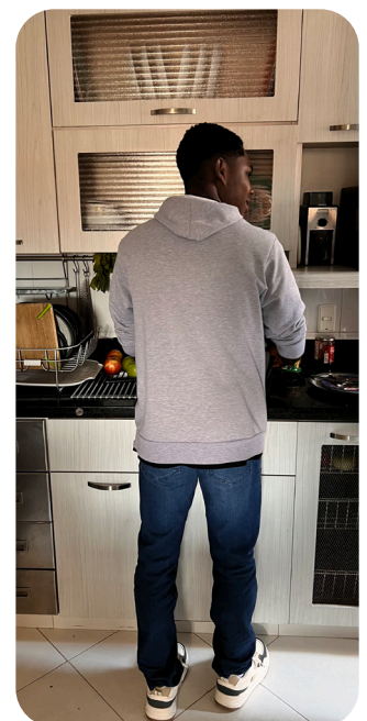
Washing dishes after youth group