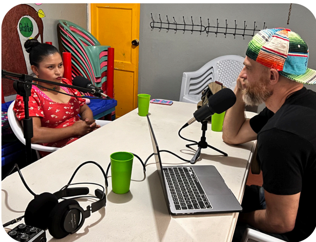
Embera Oral Bible recording session

We invite you to prayerfully consider how you, your family, and your community can make a lasting impact by partnering with us to strengthen families and churches in Colombia. Together, we can continue to share God's love and make a difference!